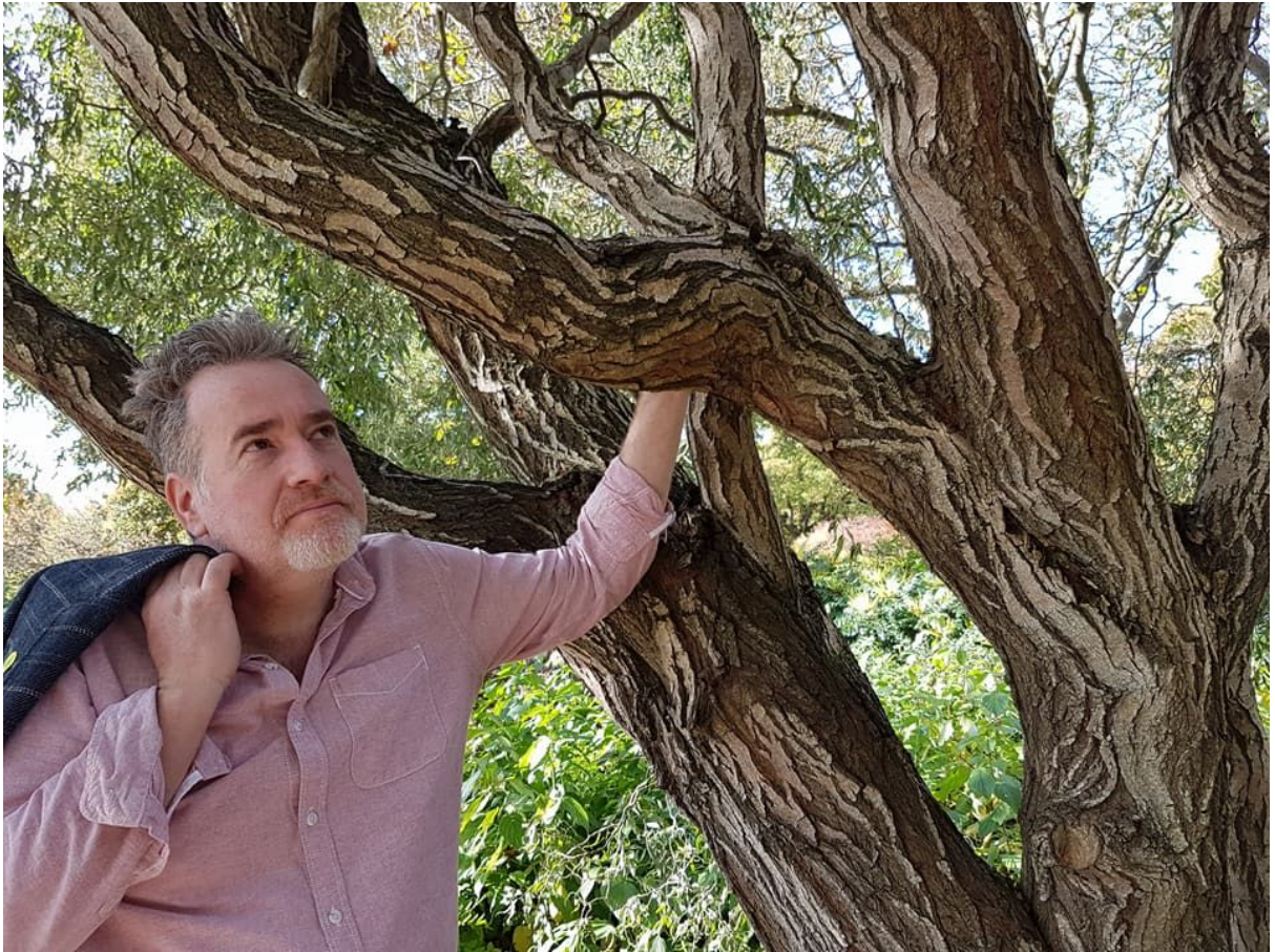
Above: Rich House