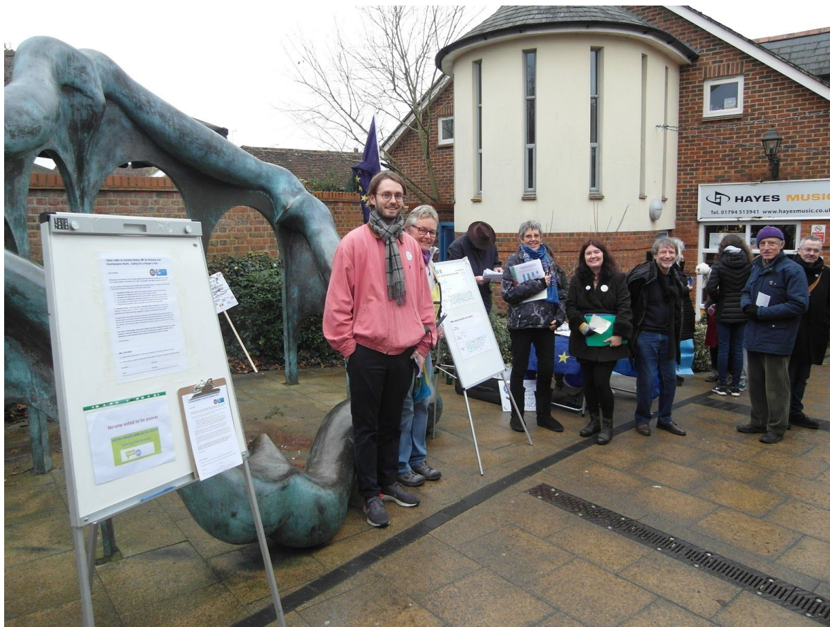
Above : Campaigners take a break in Latimer Walk. The earlier bustle of visitors to the stall was not photographed in respect of their privacy.